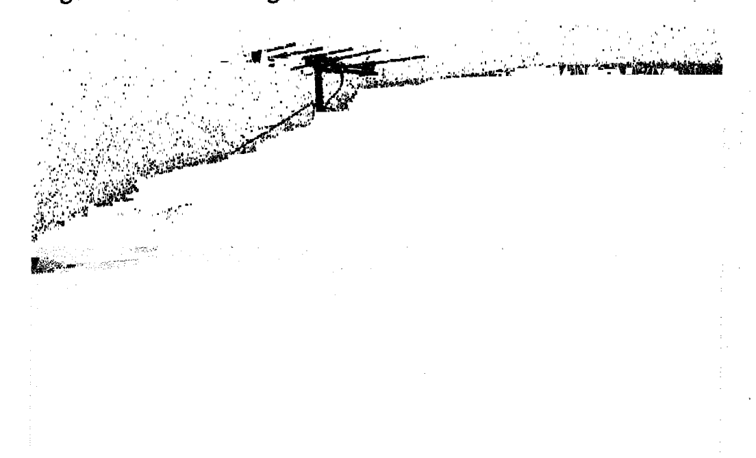
Image 4: The old seismic station (ANAT) west of the east crater, elevation is about 1,700 ft above sea level. The cloud started to cover the hilo's landing pad. The station is now transmitting seismic signals to EMO Saipan.